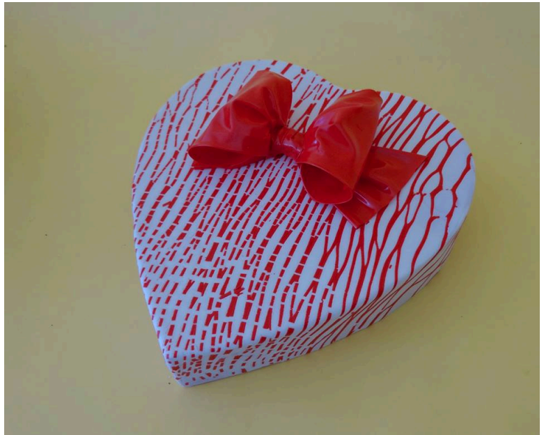
Use the mosaic technique : using dried SugarVeil Icing pressed into modeling chocolate. Then top with a “patent leather” bow by making SugarVeil “fabric” on the back of any Confectioners’ Mat. One side will be matte, while the other will be as glossy as patent leather.