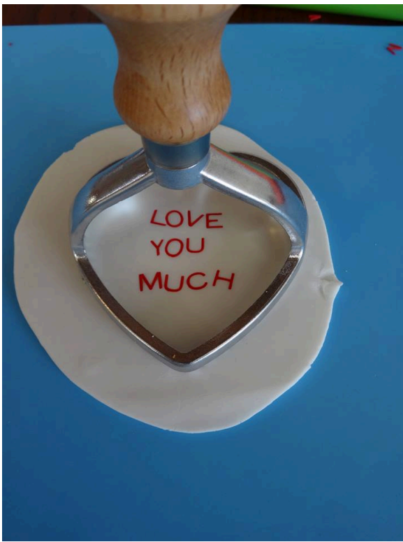
Cut out heart. (We used a ravioli cutter.)