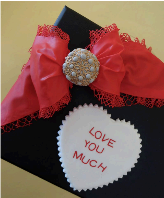
SugarVeil Brooch and Bow trimmed with edging from the Mesh Confectioners' Mat .

A "patent leather" bow is created by making SugarVeil Icing "fabric" on the back of any Confectioners' Mat. One side of the "fabric" will be matte, one side will be glossy - like patent leather.